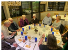
Meeting over Dinner at Cuddington Golf Club

If Rotary sounds like the organisation for you and you feel like volunteering some of your spare time, we'd like to hear from you!