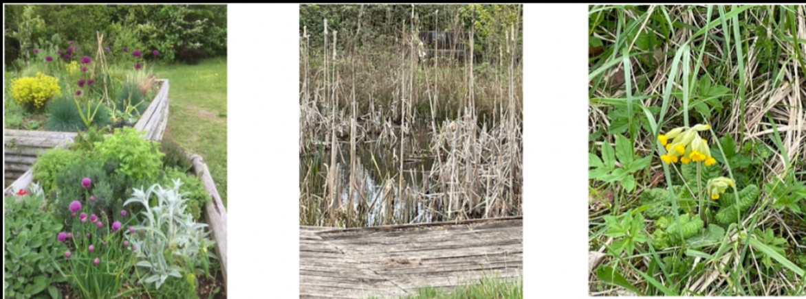
Sensory beds and pond viewing platform showing repairs needed. A pretty little cowslip.