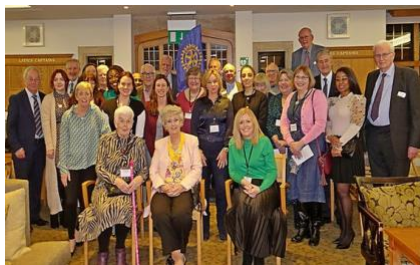
The gathering of Rotarians and their guests

We would love to see more people joining Rotary . We have a friendly and welcoming Club and want to extend an invitation to everyone who is interested in learning about how Rotary makes a difference in our community. All are welcome and just contact us via www.bansteadrotary.com .