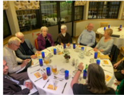
Meeting over Dinner at Cuddington Golf Club

If Rotary sounds like the organisation for you and you feel like volunteering some of your spare time, we'd like to hear from you!