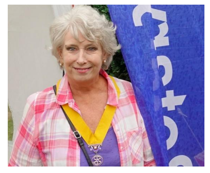
President of Banstead Rotary Club

The Royal Marsden Cancer Charity: the Charity Walk had over 80 walkers and raised an amazing £6000.